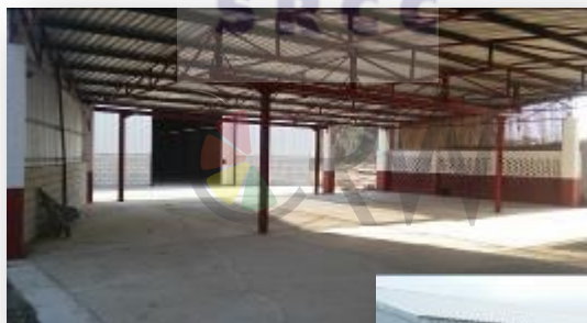
The new shed, as seen on the left and below.

Willowtree Farm has very kindly been assisting with the maintenance of the school ground of the Sundays River Valley Primary School, by making available the use of its earthmoving equipment - a meaningful way to provide support to the community.